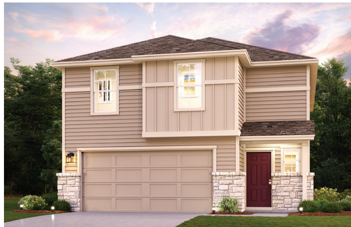
ELEVATION B WITH STONE